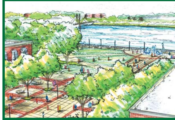
Riverfront Park, West Point, GA

The riverfront connects to a hierarchy of trails while utilizing the city's history as the focus of the design. Educational signage will denote important events and archeological items on the ground and in the river. A new pedestrian bridge will connect the historic downtown to West Point's downtown east.