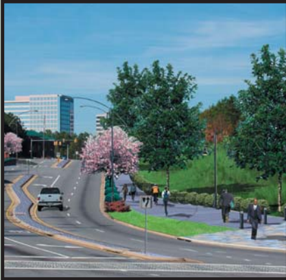
Cobb Galleria Parkway, Cobb County, GA