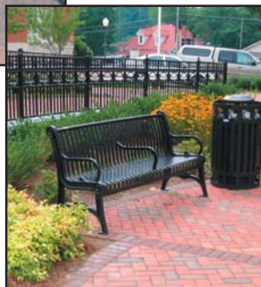
Street trees and benches, Dallas, GA

Look for us at the Georgia Municipal Association conference in Savannah